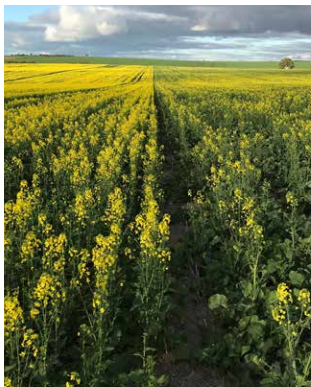
Nuseed Emu (left) sown 10th May next to 44Y27 (right) sown 20th April. Note that Emu has caught up and has a higher flowering percentage even with later sowing. Site North Kellerberrin. Photo 22 July 2021.

Nuseed Emu TF is a 'spring' canola variety that responds to temperature in a linear way, the warmer it is the faster it develops. When sown in late March or early April, development will be rapid and the crop will flower too early, exposing it to frost and disease risk that lead to potential lower yield. Many other Early/Mid varieties have a small vernalisation response which acts as a handbrake to slow them down when sown early.